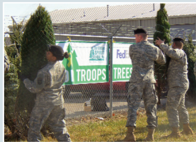
Trees for Troops at Fort Campbell, 2005.

To bolster the spirit of Christmas, Drake & Company and NCTA launched Trees for Troops, a cause marketing campaign that delivers Real Christmas Trees to U.S. military families. With the support of FedEx, in three years the program has delivered some 33,000 trees and has grown to include 850 donors.